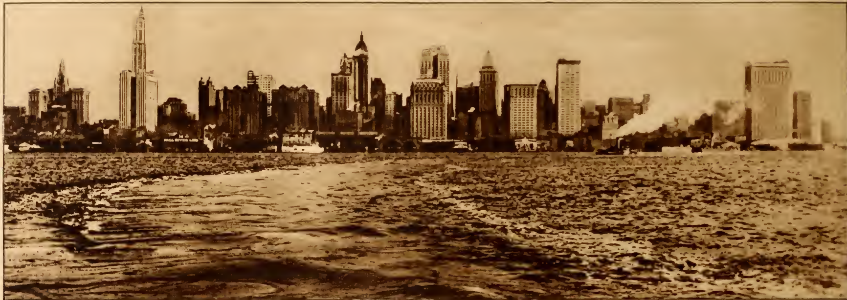
VIEW OF NEW YORK'S SKY-LINE FROM THE NORTH RIVER. Every steamer arriving from foreign ports passes this Panorama of lower New York, with its skyscrapers and factories.